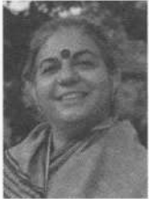
Dr. Vandana Shiva

The Keynote Speaker this year will be Dr. Vandana Shiva , a physicist, author, and international leader in multiple interdisciplinary, environmental, and sustainability movements, including the Slow Food and Biodiversity Movements, and Intellectual Property Rights (IPRs) exploration. Dr. Shiva is challenging and exploring Biotechnology and Genetic Engineering, and engaging in activism which seeks to acknowledge women's diversity and contributions to farming and science. Dr. Shiva combines sharp intellectual enquiry with courageous activism. Originally from Dehradun, India, she obtained a doctorate in Physics from the U