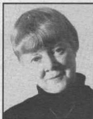
Barbara G. Walker

The Sixteenth Annual Women and Spirituality Conference will be held at Mankato State University on Saturday & Sunday, October 4 and 5, 1997. Our Keynote Speaker is Barbara G. Walker .